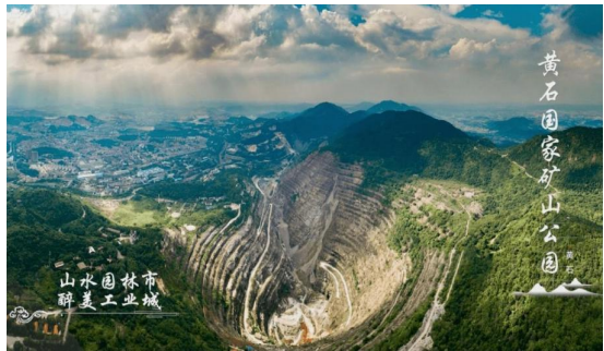
Huangshi National Mining Park