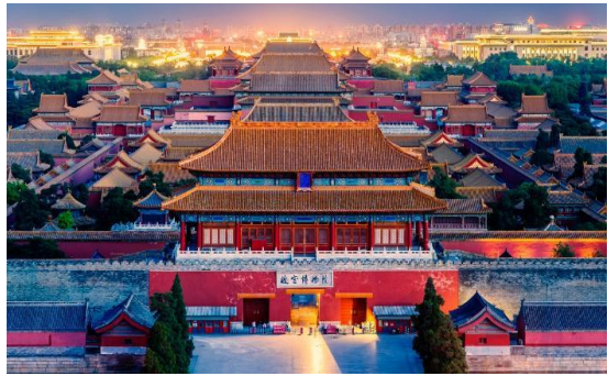
The Forbidden City