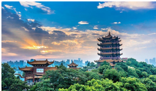
Yellow Crane Tower